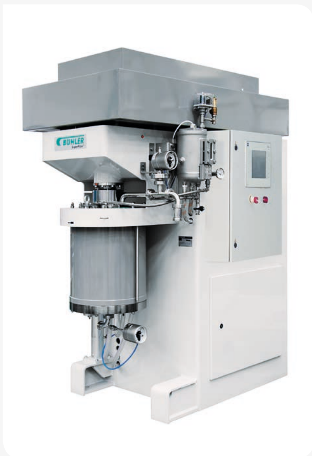
Available for Advantis™, Cosmo™, SuperFlow™