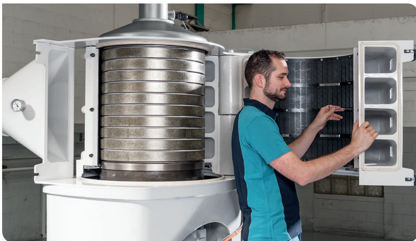
Osiris – maintenance-friendly thanks to a fold-up air channel.