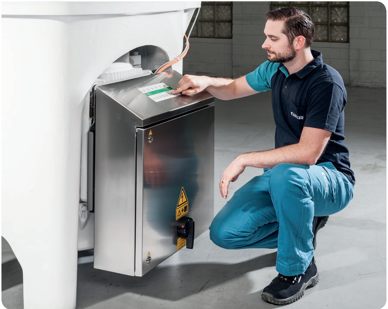
Increased level of automation with WinCos process control.