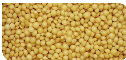
Pseudo-grain – amaranth