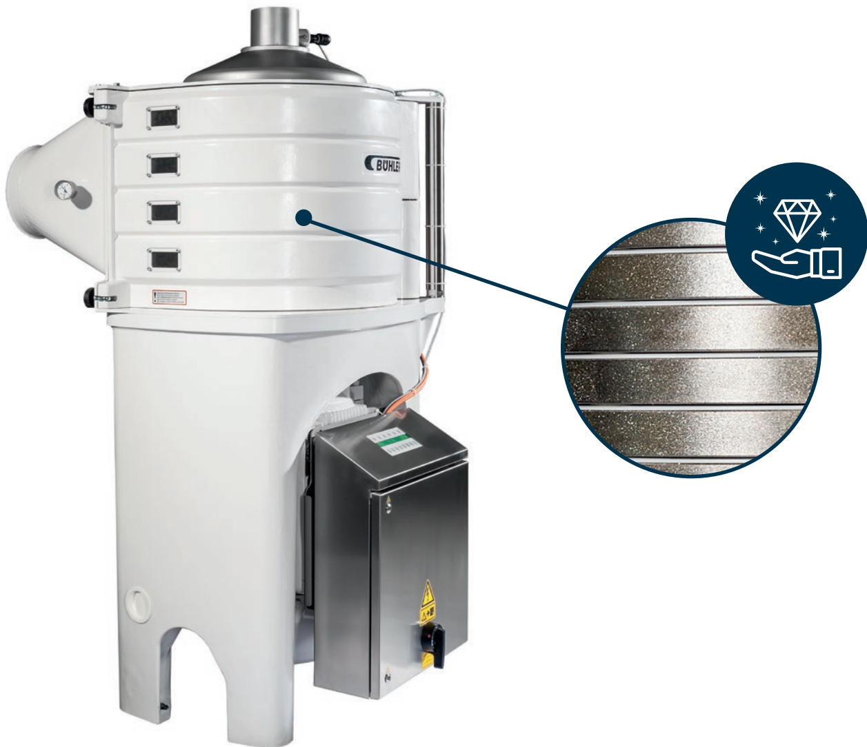
Diamond as high-efficiency grinding material.