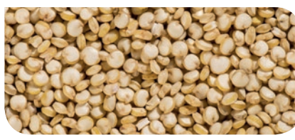
Pseudo-grain – quinoa