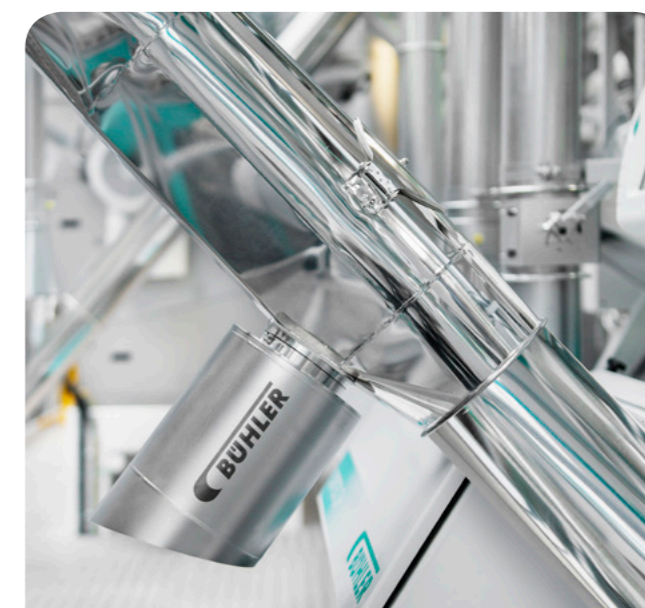
The color and speck measurement option MYHB delivers reproducible color values in the CIE 1976 color space (L*, a*, b*) and classifies brown as well as black specks according to size.